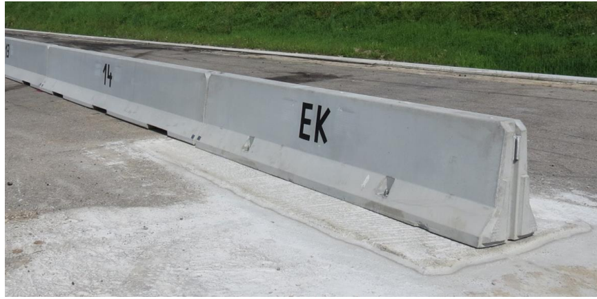
Photograph of DB80 T150S Units