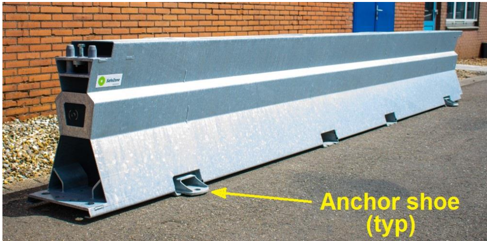
Photograph of 5.8m long element (2# anchor shoes shown)